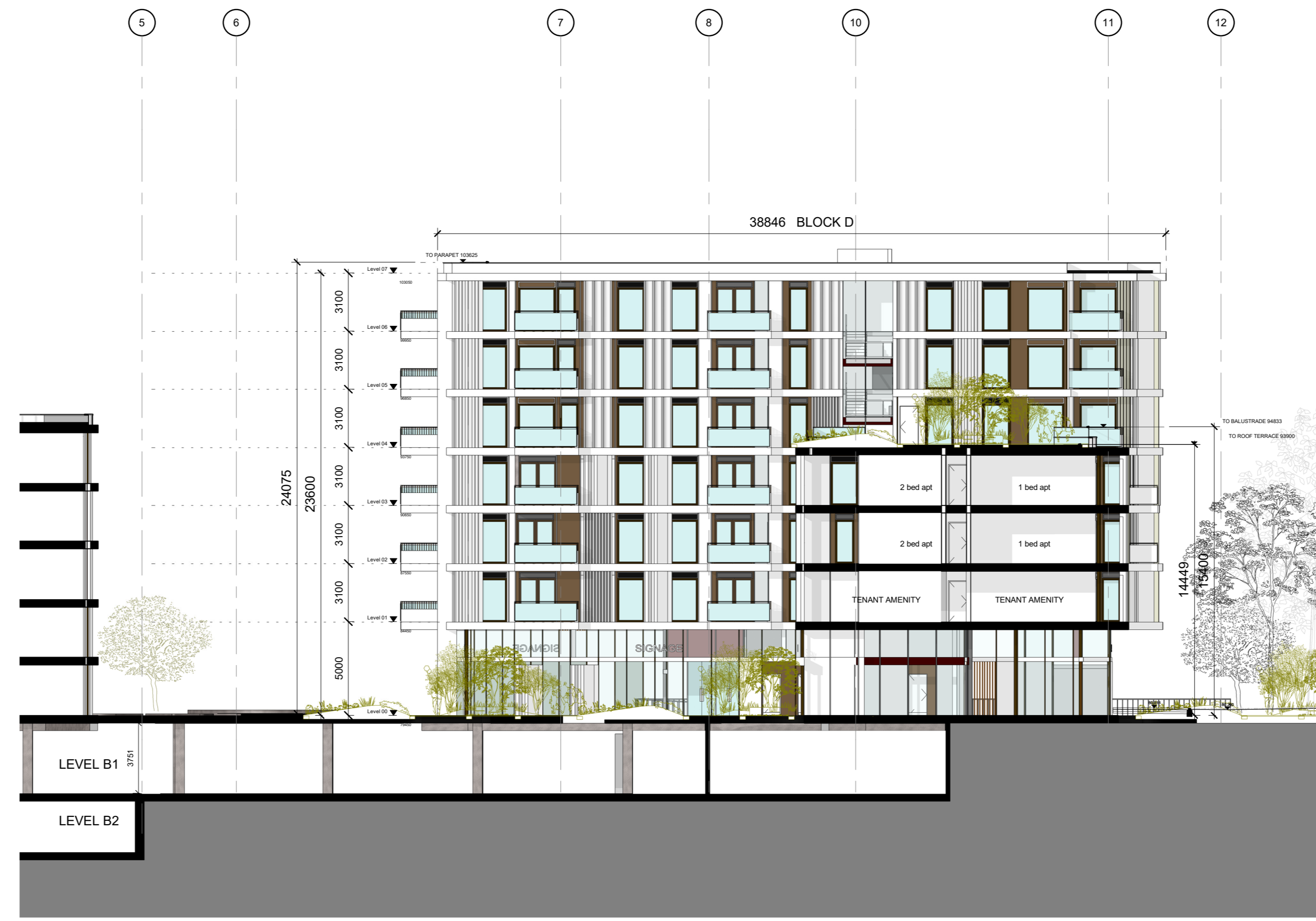
2 Block D Proposed Elevation 02 1 : 200