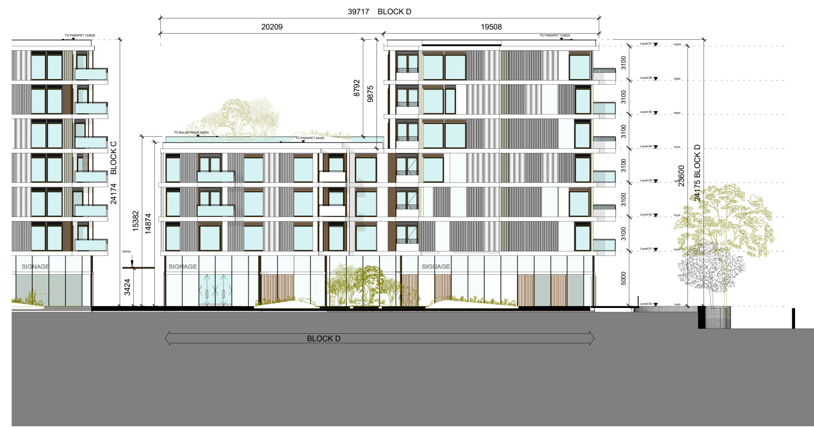
1 Block D Proposed Elevation 01 1 : 200