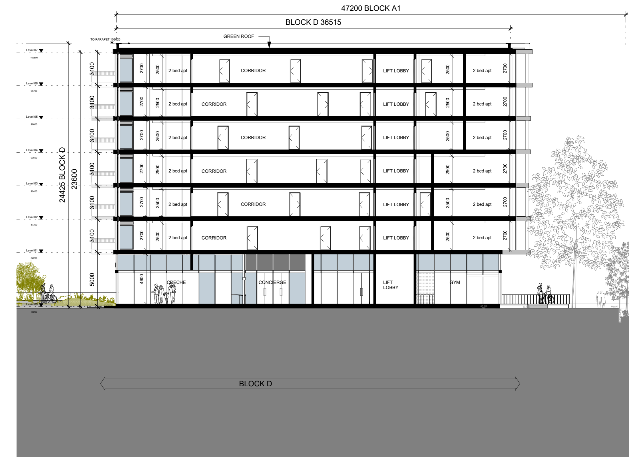
6 Block D Proposed Section 02 1 : 200