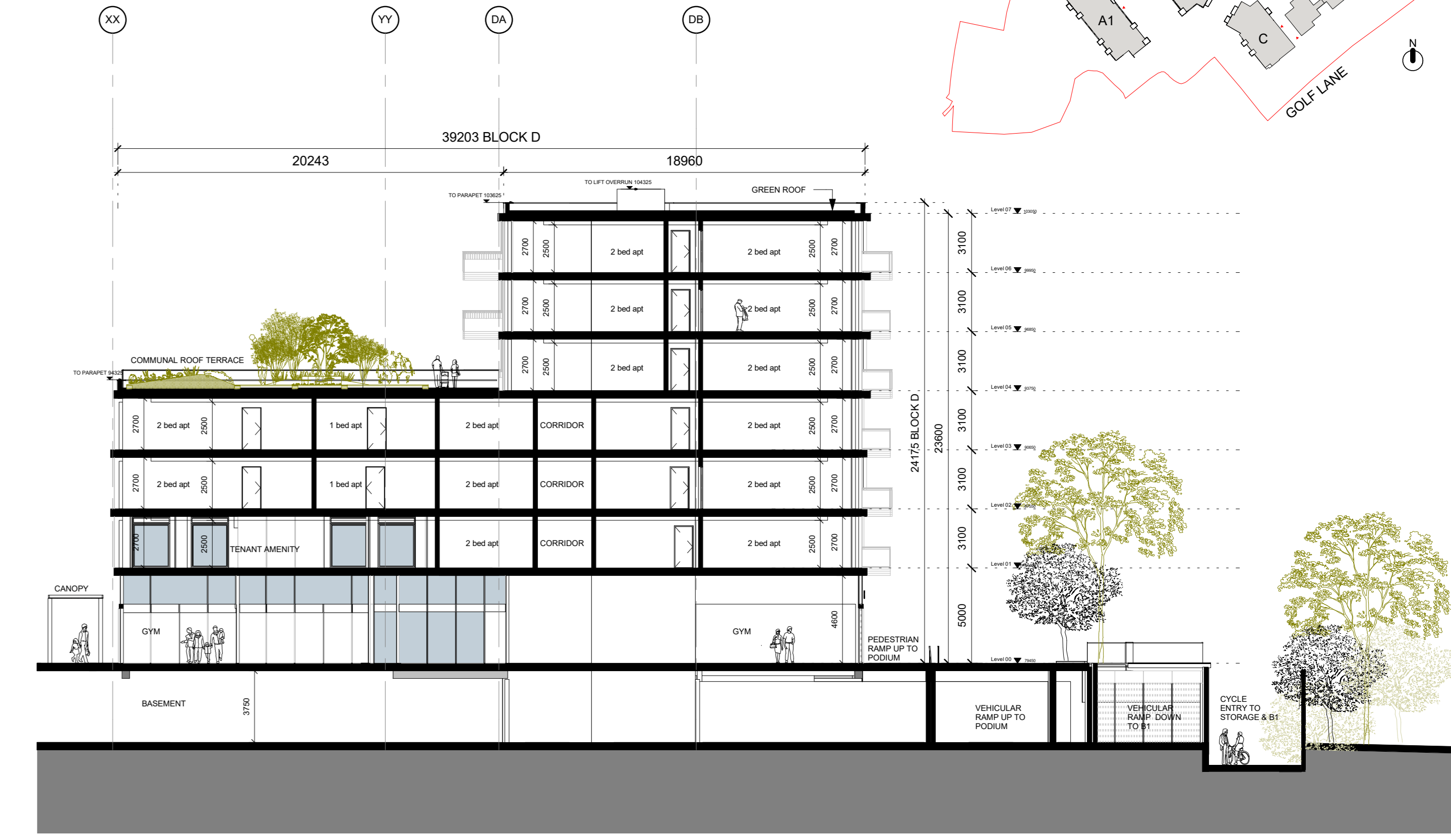
5 Block D Proposed Section 01 1 : 200