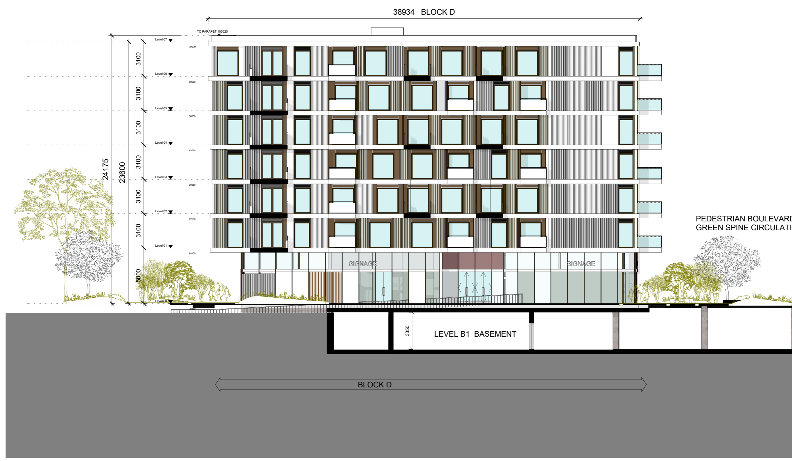
4 Block D Proposed Elevation 04 1 : 200