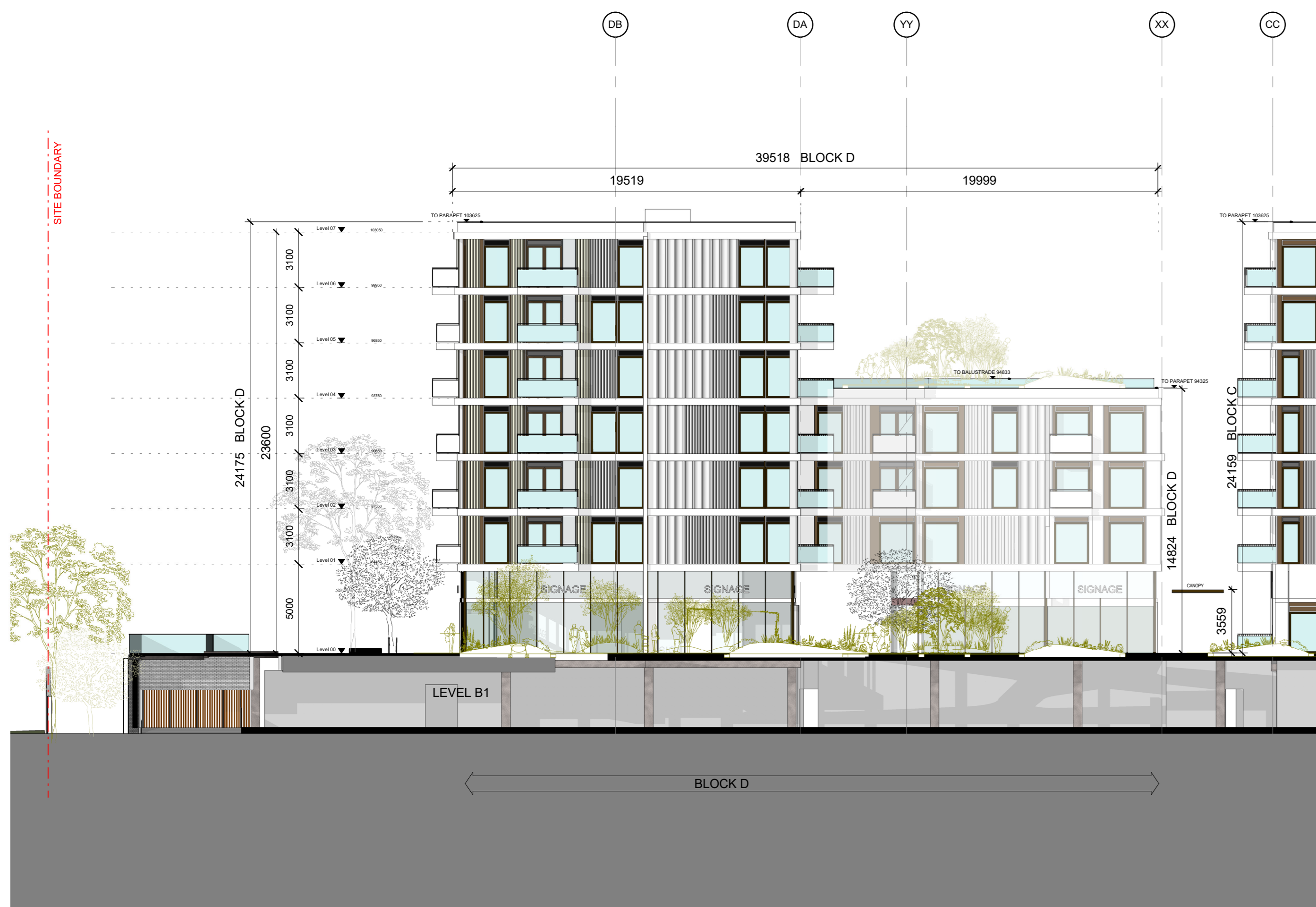
3 Block D Proposed Elevation 03 1 : 200